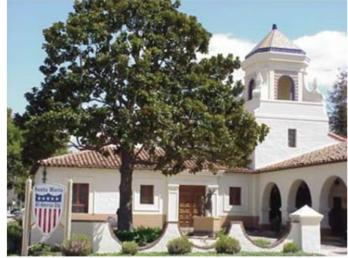
Santa Maria City Hall