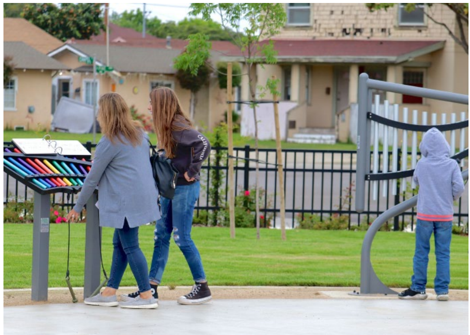
Top and bottom: Access to parks and other greenspaces, like Machado Plaza in Santa Maria's Downtown on Chapel Street, is essential to community health.