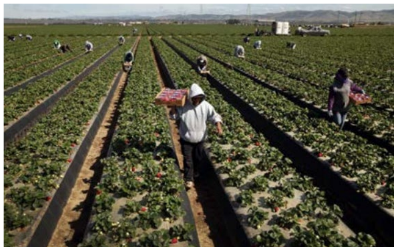
Workers employed in agriculture in Santa Maria.

The increasing number of H-2A Visa workers in agricultural jobs and the associated requirements for employers to supply worker housing have heightened the need for increasing the amount of safe and affordable housing in the city.