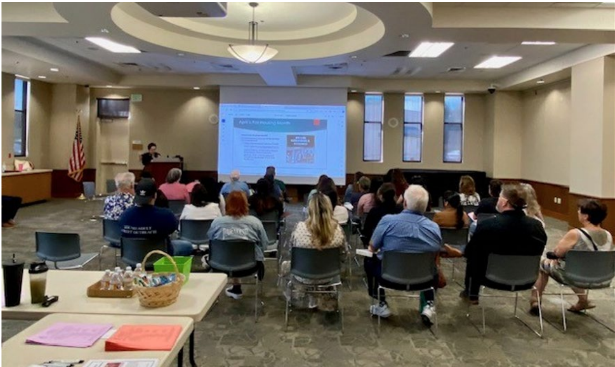
Public meeting held in Shepard Hall in the Santa Maria Library.