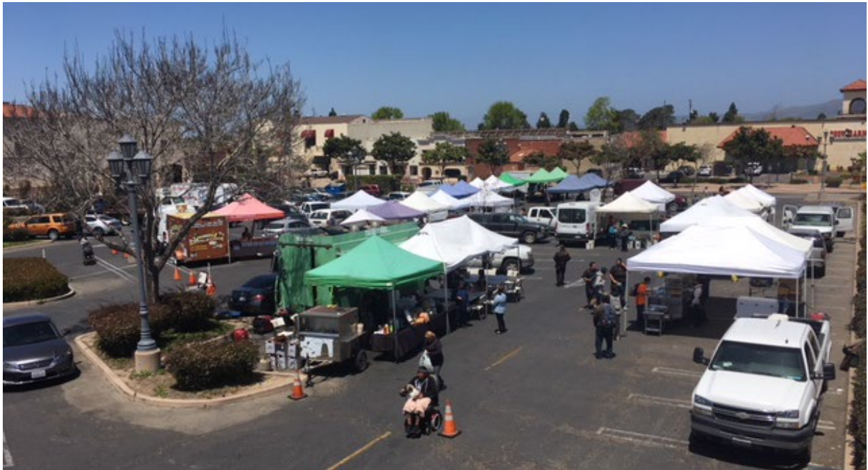
Farmers' Market in Santa Maria's Downtown

The rate of food insecurity among adults in Santa Maria (16%) is twice the rate for Santa Barbara County (8%). Food insecurity can lead to undernutrition, fatigue, stunted development, and related health issues. Access to food is most limited in the city's northeast and northwest areas, in addition to a large area southwest of Downtown. In some of these areas, 33% of the population lives more than one mile from a supermarket, supercenter, or large grocery store. During engagement activities, community members identified the need for more equitable access to nutritious food (e.g., gardens, corner stores selling healthier food), a greater variety of healthy food choices, and more affordable food.