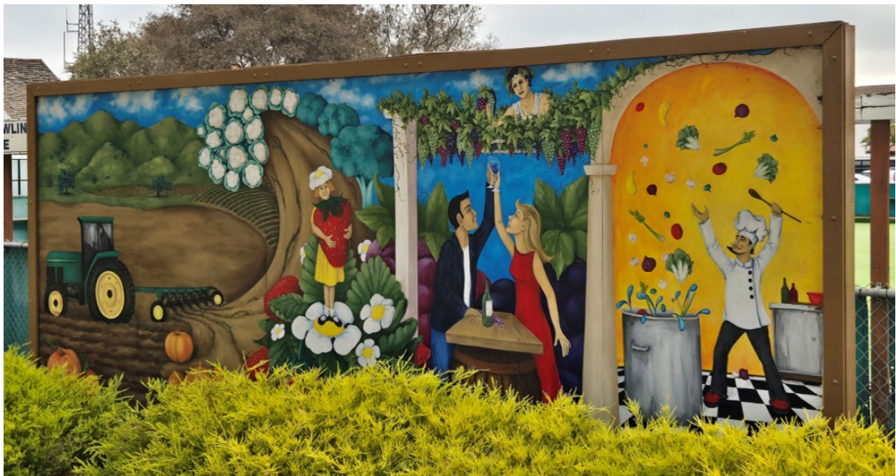
Painted mural located on South McClelland Street in Santa Maria.

The goals, policies, and implementation actions provide a roadmap for elevating the quality of life in Santa Maria by reducing pollution; promoting safe and affordable housing; enhancing opportunities to lead healthy lives through access to healthy food, active transportation, public facilities, and healthcare facilities; and fostering greater civic engagement opportunities.