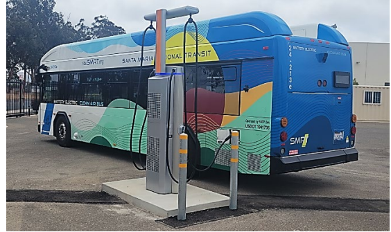
SMRT Electric Bus

A vast majority (90%) of Santa Maria residents live within a 10-minute walk to transit stops, and nearly half (46%) are close to parks. However, communities in the northern and southern parts of the city face limited walk access to parks compared to other parts of the city. During engagement activities, community members highlighted the need for improved sidewalk and public facilities maintenance, more equitable access to physical activity opportunities, beautification, dependable public transit, affordable childcare, and inclusive recreational programming.