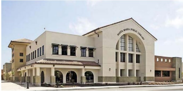
Santa Maria Public Library

Throughout the engagement process, many community members shared that they faced barriers that limit their ability to participate in City activities and decision-making, such as a lack of awareness, inconvenient meeting times, and language access. These barriers often impact low-income residents, youth, people with disabilities, and those with limited English proficiency. Specifically, youth members shared an interest in participating in the civic process but some lacked the knowledge or awareness of how and when they could participate.