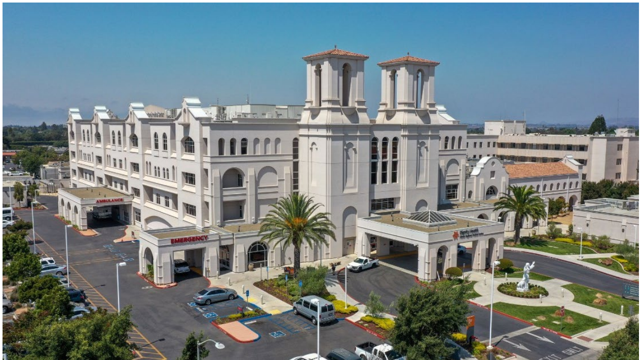
Marian Regional Medical Center.

Most of the city is designated as a Health Professional Shortage Area (HPSA) due to a lack of primary medical care for the Medicaid-eligible population and a lack of mental health care for the low-income migrant farmworker population, indicating a shortage of health providers in these fields. In Santa Maria, there are four census tracts (24.04, 24.03, 23.04, 23.05) where less than 20% of older adult men and women (65+ years) are up to date on a core set of clinical preventive services. During engagement activities, community members shared the barriers they face in accessing health and mental health care services and expressed concerns about both community safety and their interactions with law enforcement.